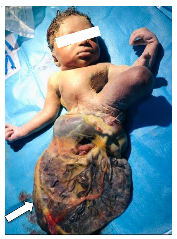
Figure 2: Immediate post-delivery, photograph depicting a body stalk anomaly. (White arrow: Attached placenta)

The neonate did not survive beyond 15 minutes of birth due to the lethal nature of the anomaly. Findings at autopsy (Figure 3) revealed a neonate with ambiguous external genitalia, the placenta was seen covering a large portion of the anterior abdominal wall defect with a transparent sac. The combined weight